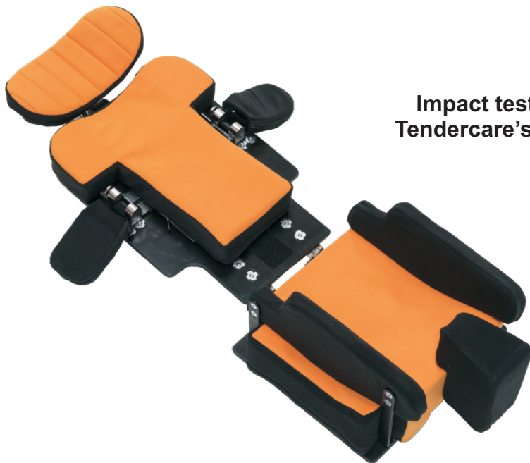
Impact tested with all Tendercare's wheelbases