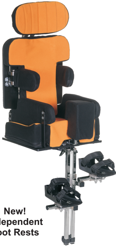
New! Independent Foot Rests

This unique modular design gives you a highly versatile postural management system that can be easily adjusted to provide your child with optimal support.