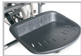
New! Moulded Foot Plate