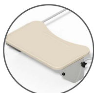
Tilting Patient Table