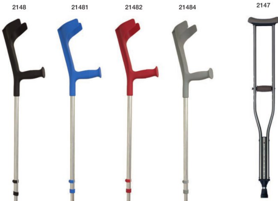
2148 Aluminum Forearm Crutch: Height adjustable. Black colour. Max. Weight.: 120 Kg. 21481 Aluminum Forearm Crutch: Height adjustable. Blue Colour. Max. Weight: 120Kg. 21482 Aluminum Forearm Crutch: Height adjustabler. Red Colour. Peso máx: 120Kg.