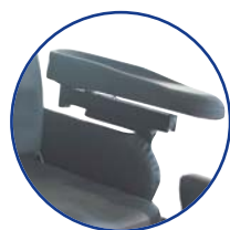
Swivelling cradled armrest