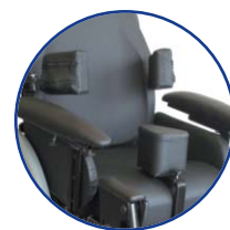
Trunk support and abduction wedge