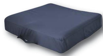
Viscoelastic foam seat cushion