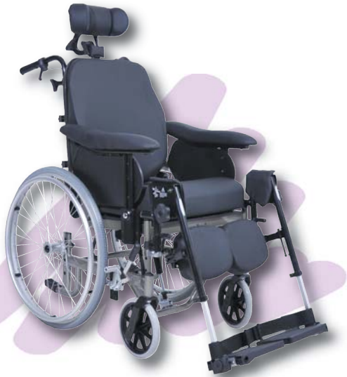
IDS soft Evolution Standard