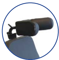
Long wings headrest