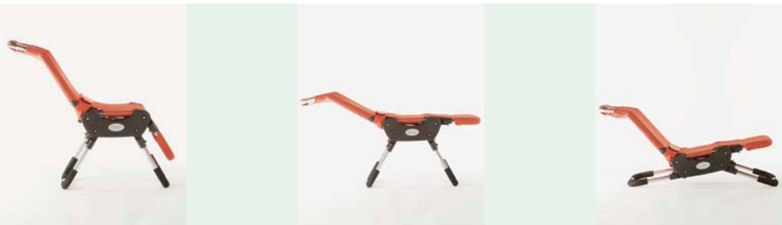
Angle-adjustable back and foot piece