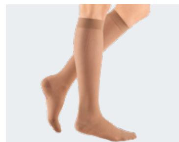
Knee length stocking (AD)