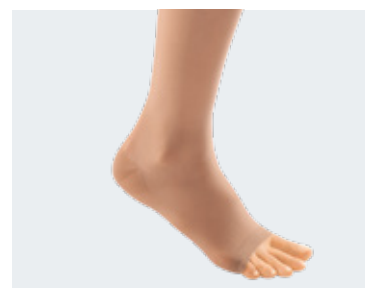
Open toe – detail