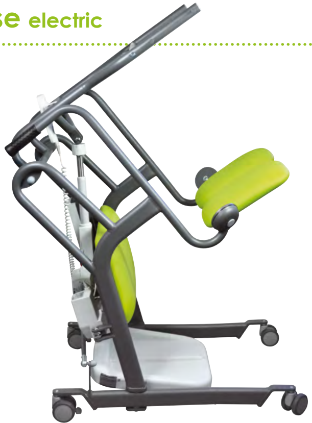
Mover Flexi Base electric with electrical height and width adjustment