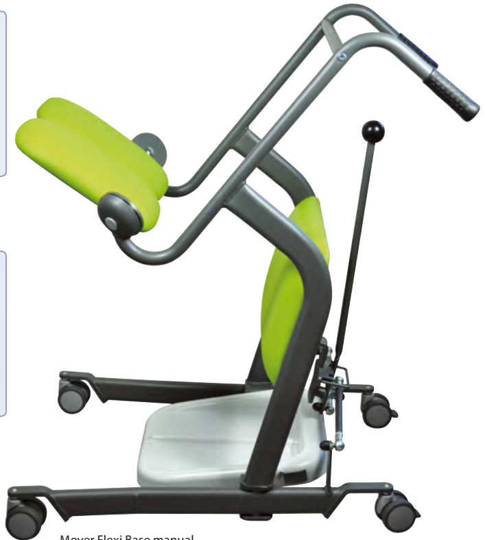
Mover Flexi Base manual

Width adjustment of the chassis by means of the setting lever.