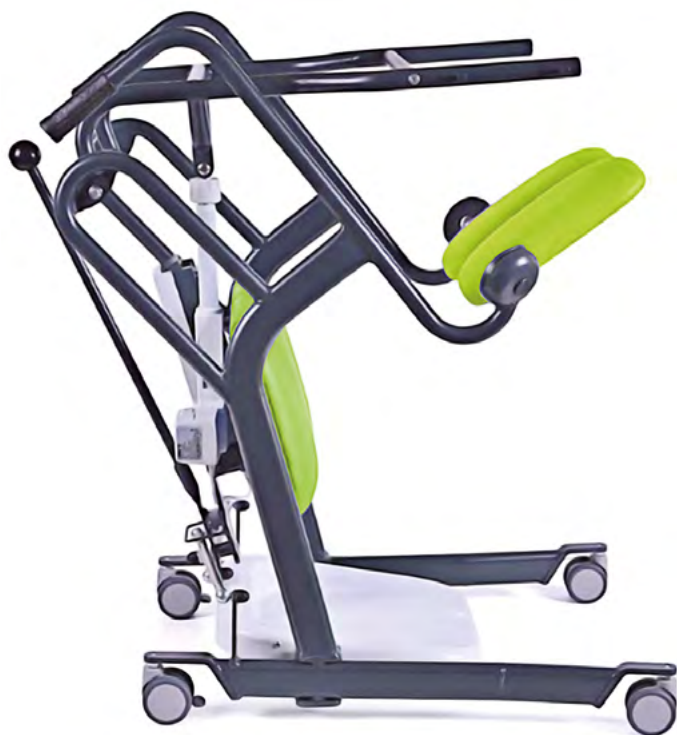
Mover Flexi Base manual with electrical height adjustment