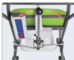
Width adjustment of the chassis by means of the setting lever at the Mover Flexi Base manual with electrical height adjustment.