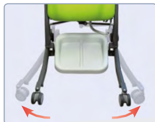
Width of the chassis.