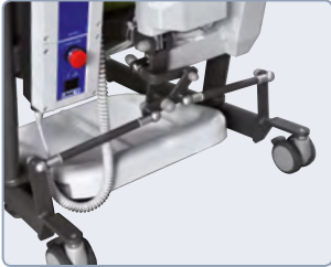
Electrical width adjustment of the chassis at the Mover Flexi Base electric.