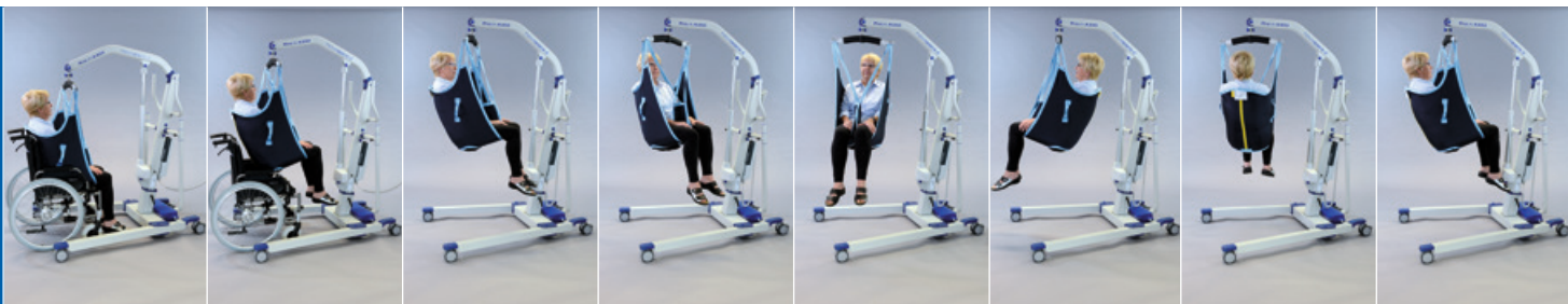
ProLift A333 in use with the Middlesupport. Further slings see page 15.