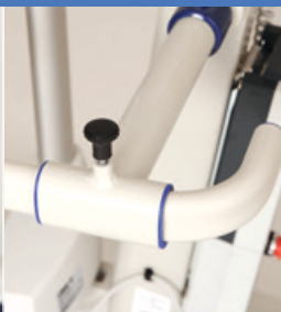
B Adjustable handle bar