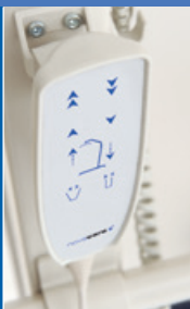
A Manual control with two speed variations