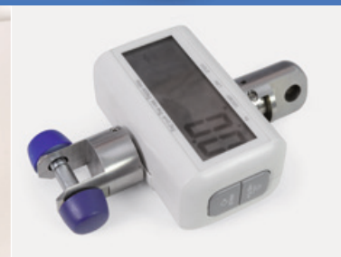
Accessories (optional): The patient scale is a class 3 scale with a max. patient weight of 400 kg.