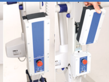
D Care electronics with intelligent cycle and operating data counter. Soft start/stop function, emergency operation for hoisting and lowering.