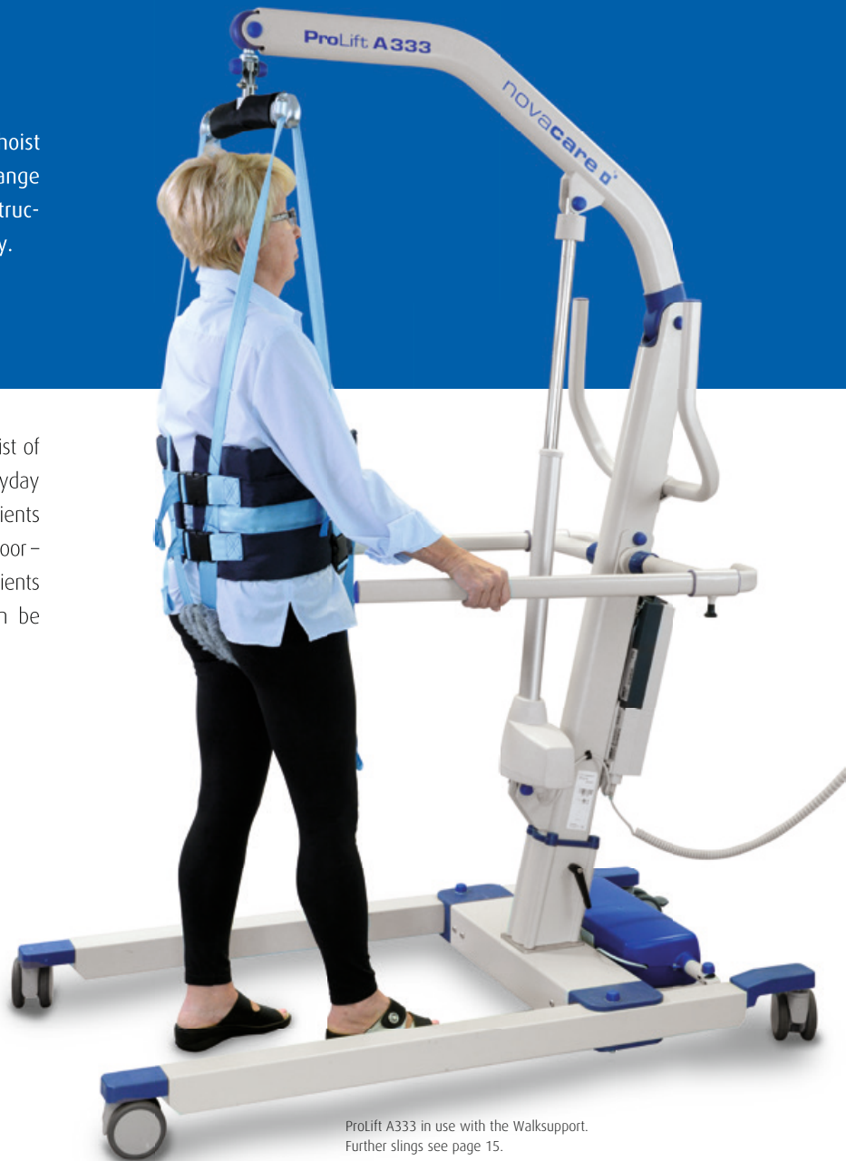
ProLift A333 in use with the Walksupport. Further slings see page 15.