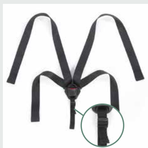
Belt extension (+ 20 cm / 7.9") incl. longer crotch strap