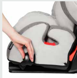
Easy and quick setting to rest position (for children of ECE group I only)