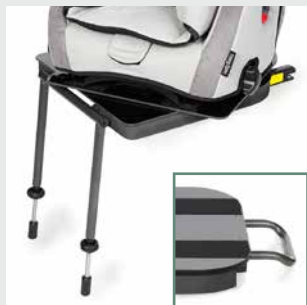
Turning plate with Seatfix connection (ECE II & III only) and stand ****