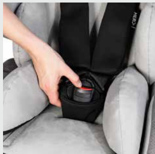
5-point harness with HERO technology