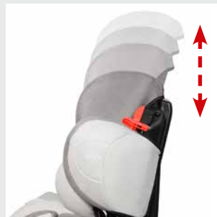
Fourfold height adjustable headrest