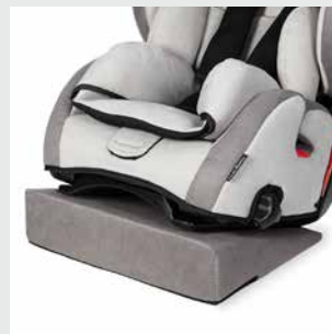
Seat wedge, below (+ 10°), max. 15° seat tilt with additional use of rest position