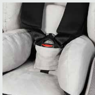
Crotch pad (large)