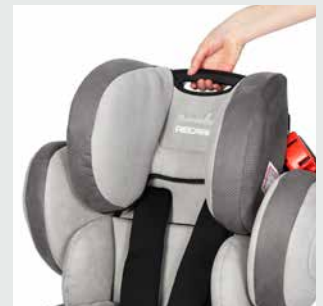
Practical carry handle