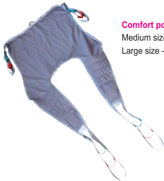
Comfort polyester strap Medium size – Ref. SA 639 0200 Large size – Ref. SA 639 0210

All the Samssoft+ straps can be used on the new Samssoft 175.