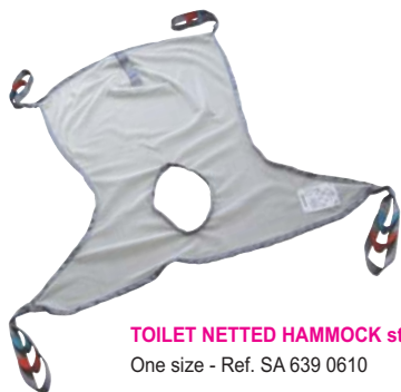
TOILET NETTED HAMMOCK strap One size - Ref. SA 639 0610