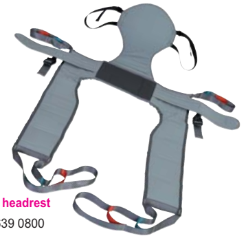
U-shaped strap with headrest One size - Ref. SA 639 0800