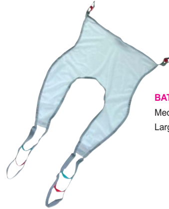
BATH netted strap Medium size – Ref. SA 639 0100 Large size – Ref. SA 639 0110