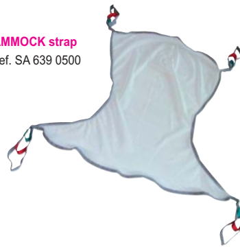
NETTED HAMMOCK strap One size - Ref. SA 639 0500