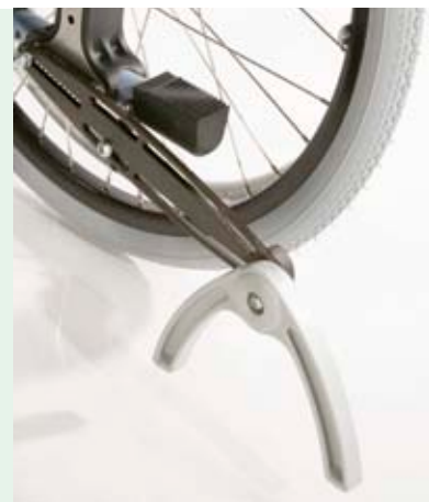
Flexible swinging anti-tipper