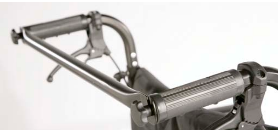
Back stabilizer, increases overall stability and can be swung out of the way for folding