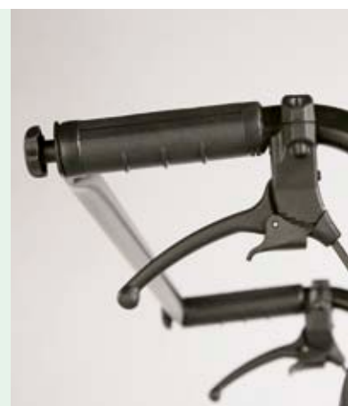
Brake lever for attendant