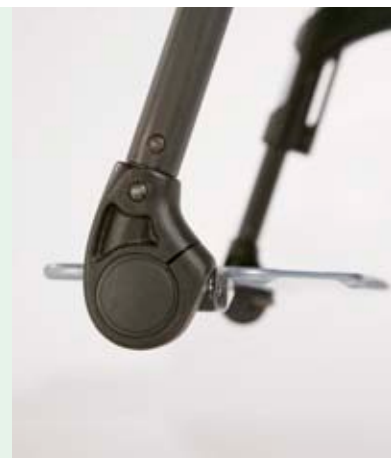
Angle adjustment of the footplate