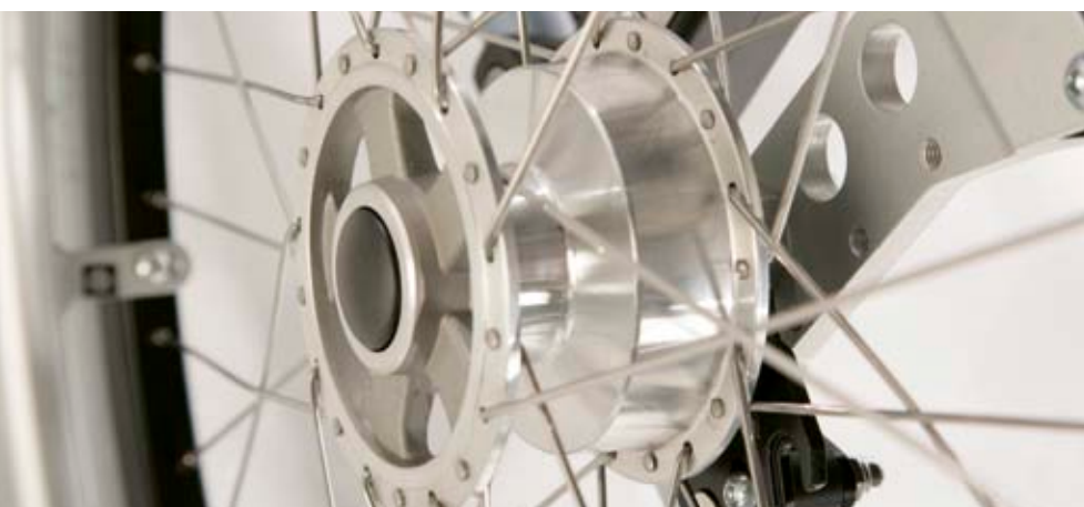
Rear wheel with drum brake system for attendant