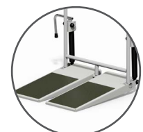
Divided Foot Boards