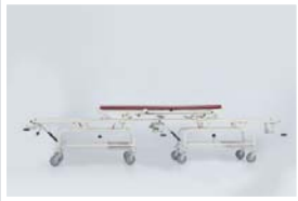
Upper platform is able to be transferred from one trolley to other trolley.