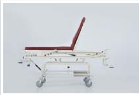
Backrest adjustment : 0 - 70°