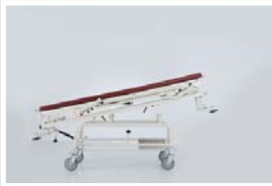
Trendelenburg position : 0 - 12°