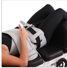
QuikWrap™ Belting System (2825) for vertebral separation/spinal distraction