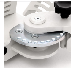
Pivoting traction mount