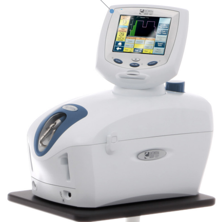
Triton DTS® traction unit