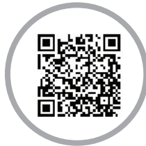
Unit specific QR code for quick access to service manuals, cleaning guides and warranty history