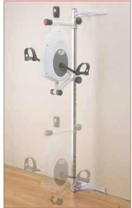
EXER II 146 x 45 x 54 (cm) / 13,5 kg Wall mount included