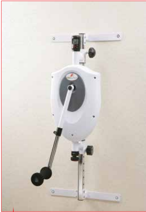
EXER I 96 x 45 x 45 (cm) / 11,5 kg Wall mount included