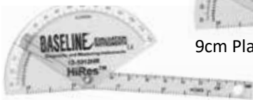
9cm Plastic Finger Goniometer