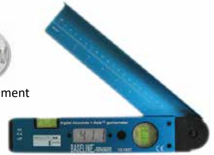
20cm Digital Metal Goniometer