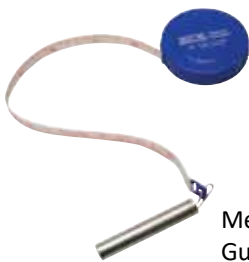
Measurement Tape with Gulick Attachment