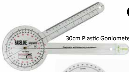
30cm Plastic Goniometer