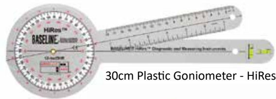
30cm Plastic Goniometer - HiRes™