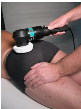
Bed Sore Prevention